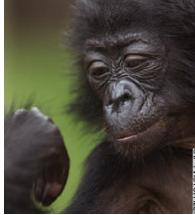
A bonobo looks at its hand in the sanctuary near Kinshasa in this picture from April.

"[Bush meat] is demanded by the urban population and as the people in the forests have no option, they are chopping down trees to make charcoal and trapping animals for bush meat," Andre said.